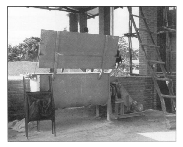
Figure 2: Prototype mechanical batch hydrator.

Quicklime is charged into the top of the hydrator in batches of 220 kg. Once the rotating agitator is turning 60 litres of water is added through holes in pipes running along the top of the machine, at a rate of 10 litres per minute. The time taken to hydrate one batch is approximately 12 minutes, after which the hydrated lime is discharged.