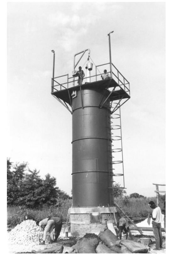
Figure 1: The improved kiln design.

Traditionally lime has been produced at Chenkumbi in large open box kilns (See Malawi lime case study No 1). The techniques employed, however, were unable to meet the demand for chemical grade lime required by the sugar processing industry, which had to import lime at considerable cost.